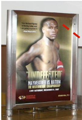
ITEM 14 - 2 LIGHT BOXES € 1,286.00 per box Size - 1.05m x 1.59m

Junction between the main lobby and the Espace Ravel