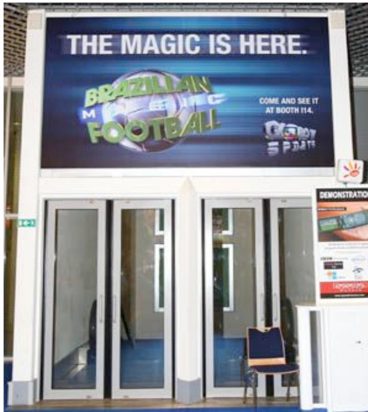
ITEM 11 - ADVERTISING PANEL