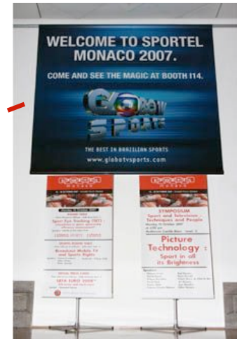
ITEM 13 - ADVERTISING WALL With additional lighting € 5,100.00 Size - 3.75m x 4.15m