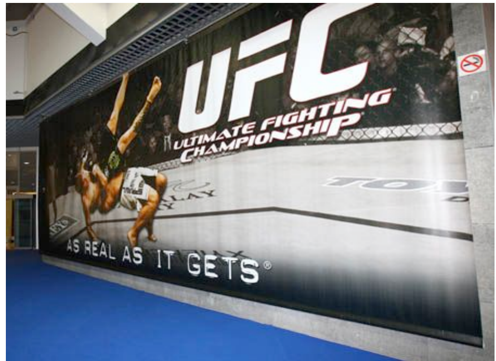
ITEM 12 - 2 ADVERTISING WALLS