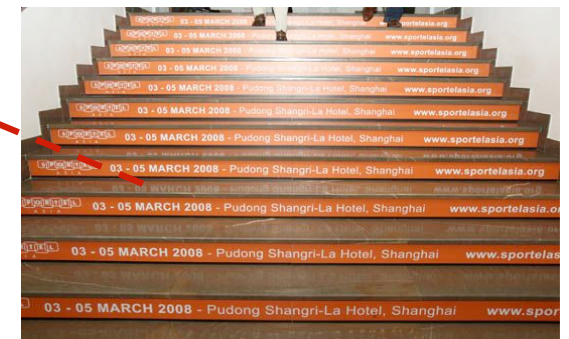
ITEM 15 - STAIR RISERS € 2,652.00 12 Stairs